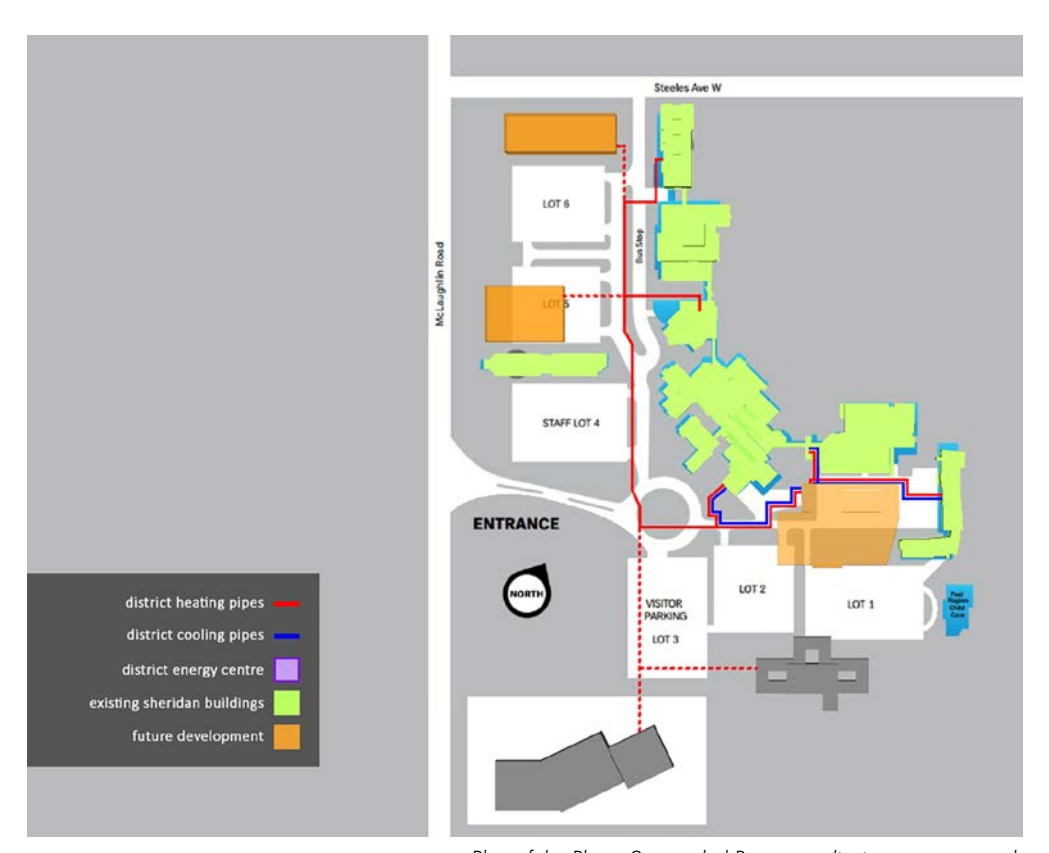
Plan of the Phase 2 extended Brampton district energy network.

This $21.4m project is supported financially by the Federal Government through its Post-Secondary Institutions Strategic Investment Fund ($9.9m), the Provincial Government ($2.2m), with the remainder coming from Sheridan College itself.<sup>14</sup>